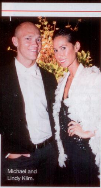
Michael and Lindy Klim.